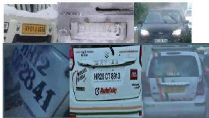
Figure 1 Various Conditions of number pates

The project introduces an innovative approach to automate vehicle number plate recognition on National Highways (NH), enhancing security and efficiency in monitoring vehicle movement. By leveraging advanced technologies such as object detection, 3D environment construction, virtual line generation, and path planning, the system enables vehicles to seamlessly traverse NH roads. The primary objective is to monitor the entry and exit of vehicles on NHs, crucial for ensuring safety and security while facilitating smooth traffic flow. At the core of the system lies automatic number plate recognition (ANPR) using optical character recognition (OCR) algorithms. Machine learning-based cameras strategically placed at road junctions capture vehicle number plates, and the images undergo processing to extract plate numbers accurately. Gaussian filters are employed to eliminate image noise and enhance plate clarity, ensuring reliable identification. The recorded entry and exit details are stored in a centralized database, enabling efficient monitoring and analysis of vehicle movement patterns. One of the key features of this system is its ability to detect theft vehicles attempting to enter NH roads.