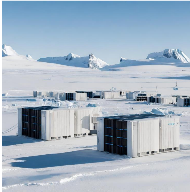
Fig. 1. A representation of using natural green resources to enhance the computation and reduce additional costs.

A key component of the larger project of green computing in the cloud is center operations. In addition to being in line with environmental sustainability objectives, this strategic move towards clean energy also offers cloud service providers a strong financial argument. Through the use of renewable energy sources in place of fossil fuels, these providers may significantly reduce their carbon footprint, save operating expenses, and help create a more environmentally sustainable world. This viewpoint explores the many potential and obstacles related to the integration of renewable energy sources in data centers, providing insight into the way forward for achieving both cost-effectiveness and environmental responsibility.