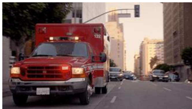
Figure 1 Existing System